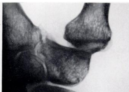
FIG. 8 Osteophyte formation on the medial and distal angle of the trapezium, and lateral subluxation of the metacarpal.