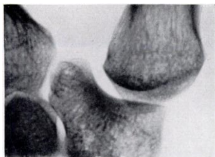
FIG. 3 Exaggeration of the normal concavity of the trapezium and prolongation of the medial and distal angle.