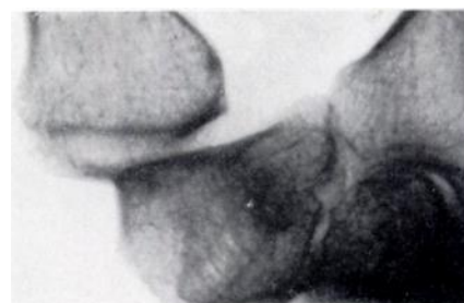
FIG. 6 Showing marked physiological subluxation of the metacarpal.