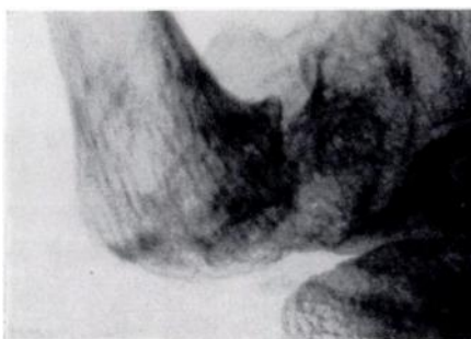
FIG. 10 La forme subluxante maxima : the base of the metacarpal is level with the trapezio-scapoid joint.