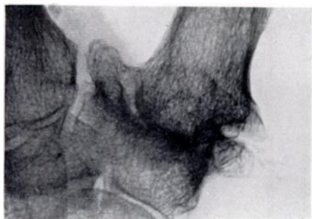
FIG. 9 To show osteophytes of unusual size at both the lateral and medial margins of the joint.