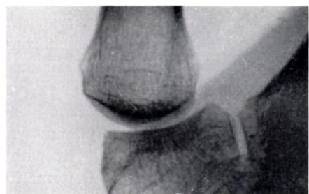
FIG. 5 In adduction of the thumb the base of the metacarpal glides laterally.