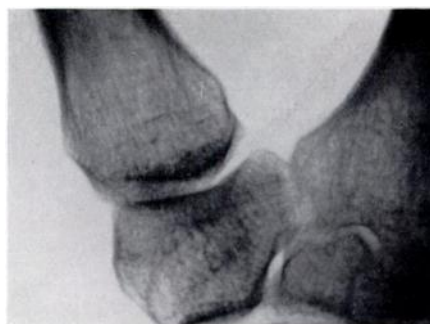
FIG. 4 In abduction of the thumb the base of the first metacarpal exactly fills the transverse hollow of the trapezium.