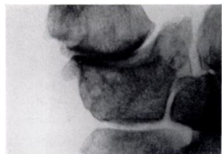
FIG. 7 Showing narrowing of the joint space, sclerosis of subchondral bone and osteophyte formation.