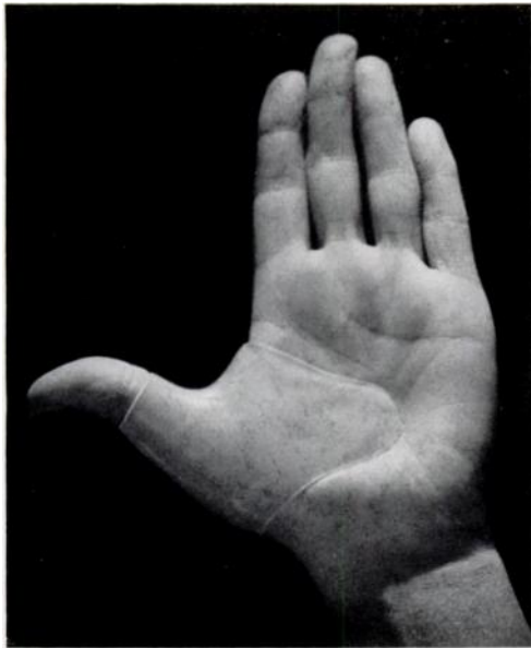
FIG. 11 A suitable appliance.

1) Early trapezio-metacarpal arthritis —Very often symptoms first arise during manual work. Radiographic changes in the joint may include: a ) Narrowing of joint space. A